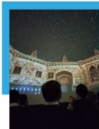
Sonning Spirituality Day