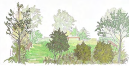
*Artist's impression of the Woodland Garden

The garden will promote wellbeing, increase pupils' access to the natural world, increase biodiversity across our site and provide greater opportunity for outdoor learning. Pupils will be busy after the Easter holidays adding their own spin to the garden design, preparing the space and planting over 40 different varieties of plants and trees.